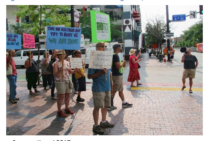
Figure 3.9.C. Protestors in Boise on August 22, 2017

Civil disturbances generally do not influence or impact the initiation of natural hazards. It is plausible though, humans could be the cause for either a wildfire event or a dam/levee/canal failure. Such an incident would most likely be classified as an arsonist or terrorist event. Additionally, human actions in the midst of a natural disaster can cause a civil disturbance. During a wildfire or flood event, some homeowners may choose not to evacuate, causing first responders more danger when responding to the disaster. An example of this is homeowners not evacuating during a fire,