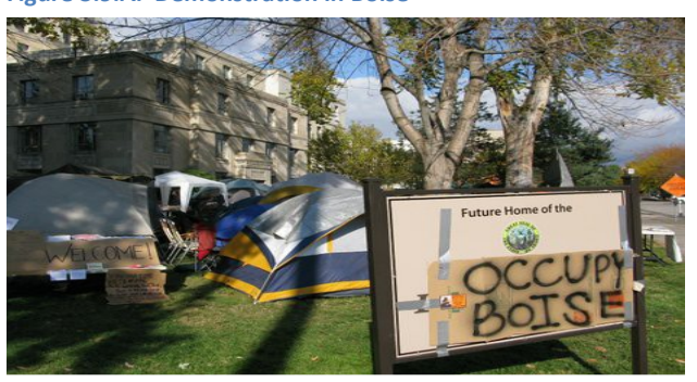
Figure 3.9.A. Demonstration in Boise

Gatherings in protest are recognized rights of any person in the U.S., and most protestors are lawabiding citizens who intend that their protests be nonviolent. Some protest planners depending on severity insist that the event involve some sort of violence, often to drive home an issue. Violence is often the result of demonstrators conducting unlawful or criminal acts. The depth of violence is determined by the willingness of the demonstrators to display and voice their opinions in support of their cause.