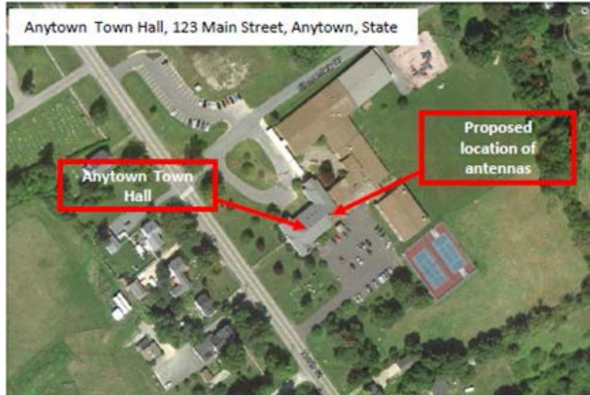
Figure 1. Example of labeled, color aerial photograph.

Aerial Photographs. The example in Figure 1 provides the name of the site, physical address and proposed location for installing new equipment. This example of a labeled aerial photograph provides good context of the surrounding area.