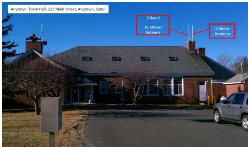
Figure 2. Example of ground-level photograph showing proposed attachment of new equipment.

Ground-level photographs. The ground-level photograph in Figure 2 supplements the aerial photograph in Figure 1, above. Combined, they provide a clear understanding of the scope of the project. This photograph has the name and address of the project site, and uses graphics to illustrate where equipment will be installed.