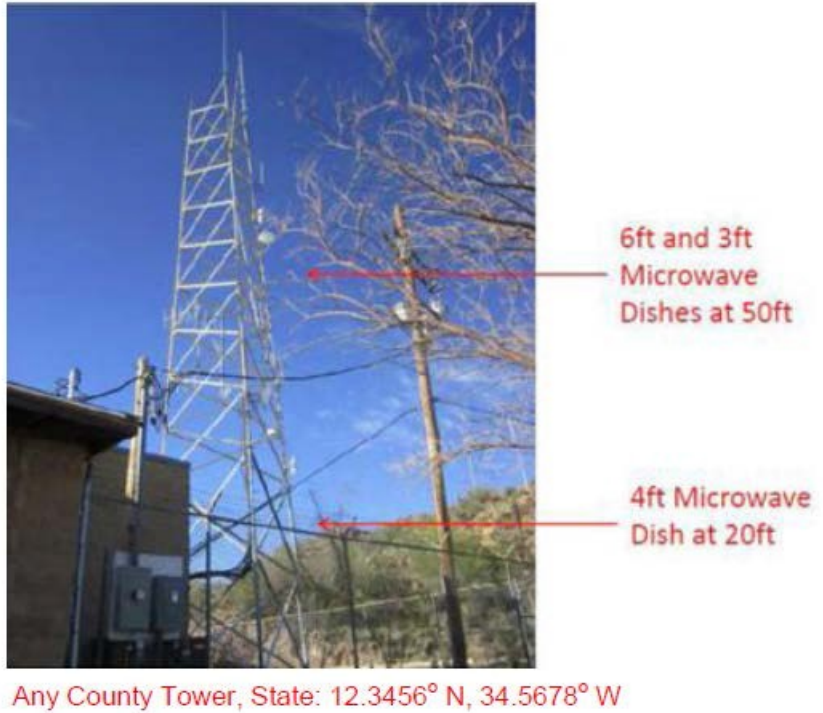
Figure 5. Ground-level photograph showing proposed locations of new communications equipment on an existing tower.

Communications equipment photographs. The example in Figure 5 supports a project involving installation of equipment on a tower. Key elements are identifying where equipment would be installed on the tower, name of the site and its location. This example provides site coordinates in decimal format.