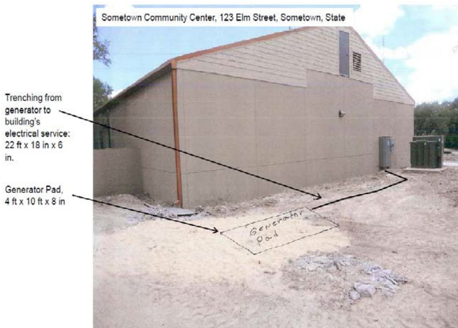
Figure 4. Ground-level photograph showing proposed ground disturbance area.

Ground-level photograph with excavation area close-up. The example in Figure 4 shows the proposed location for the concrete pad for a generator and the ground disturbance to connect the generator to the building's electrical service. This information can be illustrated with either an aerial or ground-level photograph, or both. This example has the name and physical address of the project site.