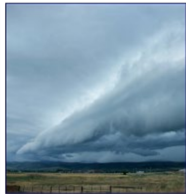
Mesoscale (Weather systems— e.g., squall lines)