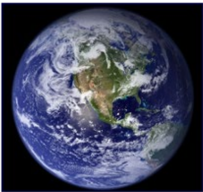
Global Scale (Largest patterns)