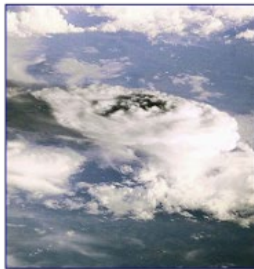
Synoptic Scale (Affects one or several States)