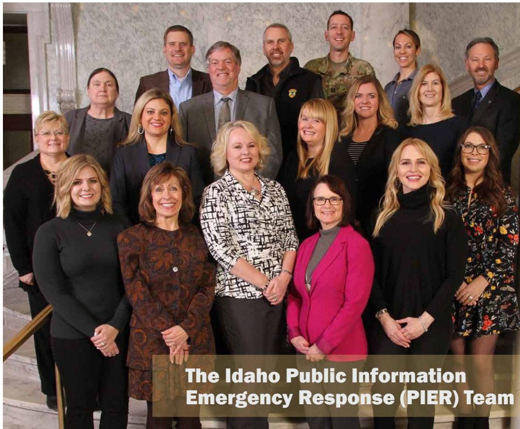
The Idaho Public Information Emergency Response (PIER) Team